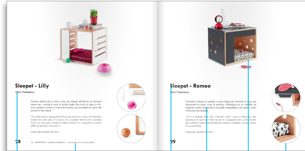
Name of the designer

The book is published in both English and Italian and all the textual contents are bilingual. Moreover the projects are presented through photos, still life photos/renderings, images of the details.